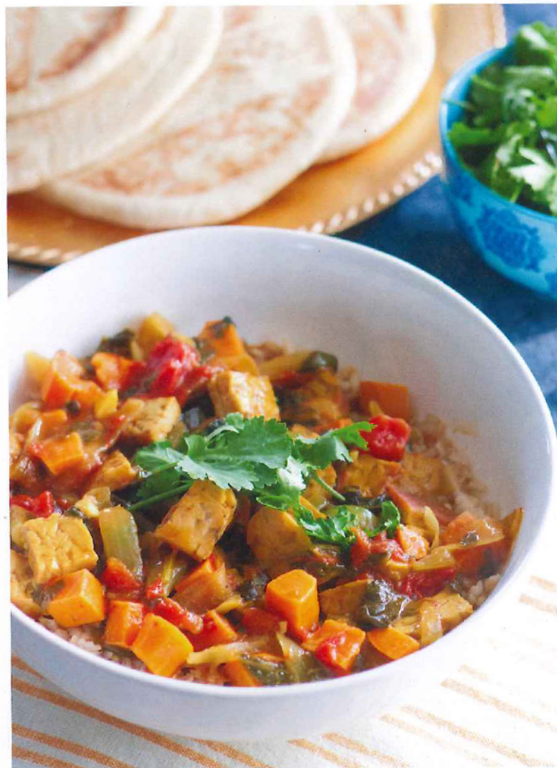
The majority of Tofurky users are flexitarians (who eat meat and fish only occasionally); vegetarians and vegans account for less than 20% of purchasers.

plant-based protein products, a world where R&D teams are scrutinizing animal and plant protein at the molecular level in a bid to create plant-based offerings with taste and textural properties comparable to beef and chicken. Their efforts have drawn the attention—and capital—of investors as notable as Bill Gates as well as recognition from culinary superstars like Alton Brown. The chef said in a recent magazine article that Beyond Meat chicken-free strips could be substituted for chicken in about 30% of all recipes that use the real thing (Brown, 2013). Gates is also an investor in San Francisco-based Hampton Creek, where scientists reportedly screened 3,000 plants to arrive at the optimal ingredients for the company's plant-based egg substitute, which is used in its Just Mayo and Just Cookies refrigerated cookie dough (Packaged Facts, 2014).