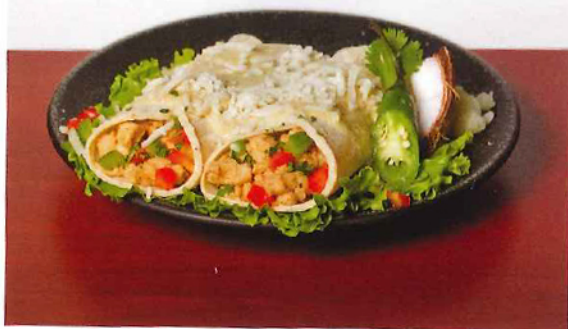
StarLite Cuisine highlights its use of pea protein on packaging for Enchiladas Suizas.