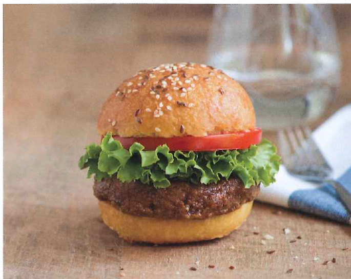
With the addition of eggs and water, meat replacer Neat yields a meal in minutes.