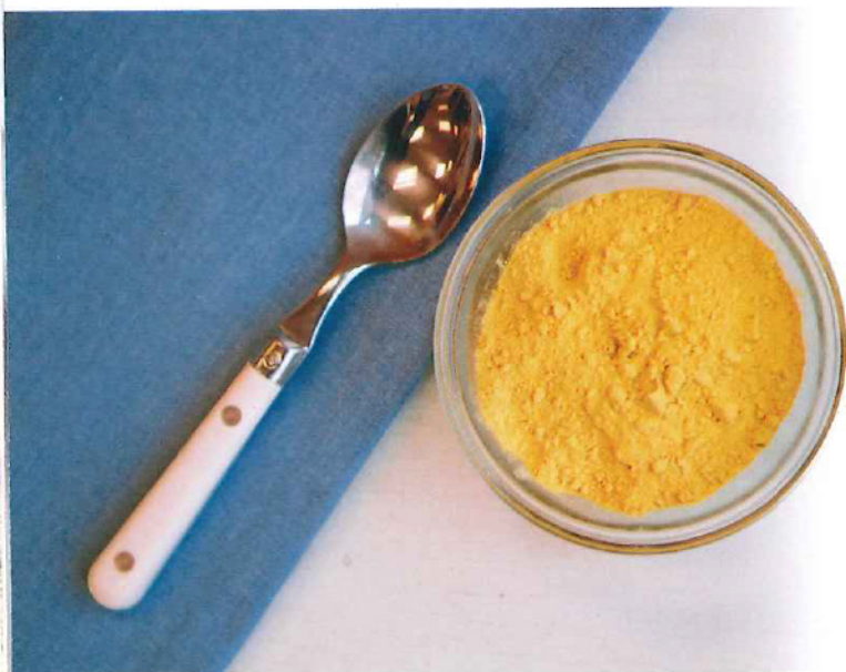
AlgaVia™ whole algal protein has applications in a broad range of food and beverages, including baked goods, soups, sauces, and meat alternatives.

Post's Great Grains Protein cereal (Cheatham, 2014). When StarLite Cuisine was working to formulate its frozen vegan enchiladas, the company opted for pea protein from Roquette instead of soy, says Lim. "We're very pleased with the pea protein," says the company president, adding that its neutral flavor is a plus. StarLite even highlights the fact that the enchiladas are made with pea protein on the front of its packaging.